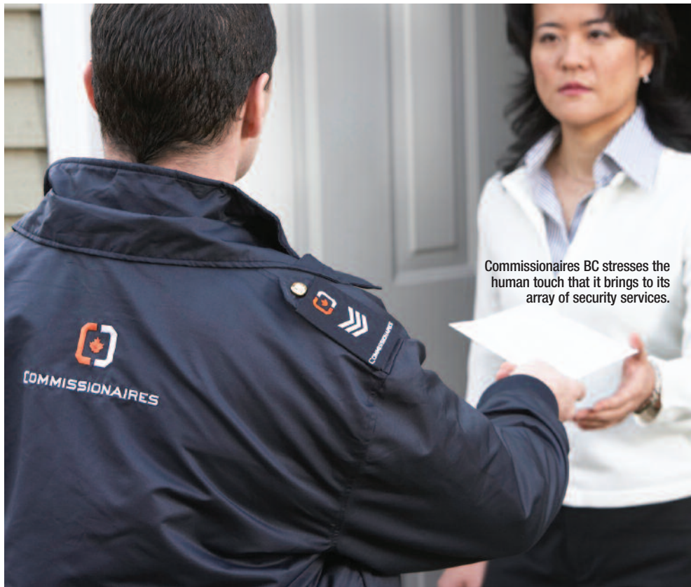
Commissionaires BC stresses the human touch that it brings to its array of security services.

“Really what we’re saying to clients is, ‘Tell us what you need, and we’re going to do it.’”